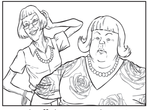
Popped off by a peach - sisters Sponge and Spiker.

<u>Picking up speed,</u><sup>7</sup> <u>the</u> <u>fiendish peach</u><sup>6</sup> hurtled down the hillside towards the