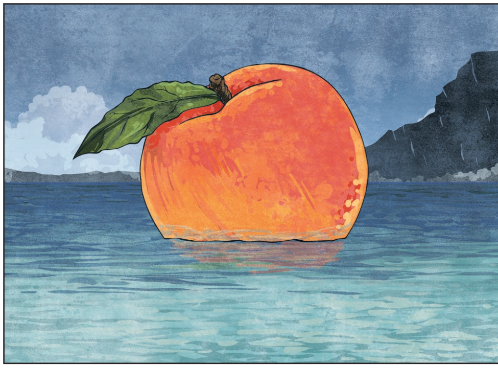
The peach at sea.

6 noun phrases expanded by the addition of modifying adjectives and prepositional phrases, e.g. the strict teacher with curly hair.